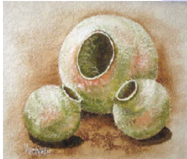
Three Pots: Feb 8

Questions: call 480-983-6221 or visit us at www.XperienceTheJoy.com