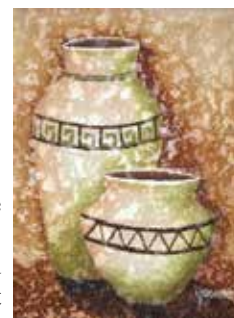
Southwest Pottery: Mar 13

Questions: call 480-983-6221 or visit us at www.XperienceTheJoy.com